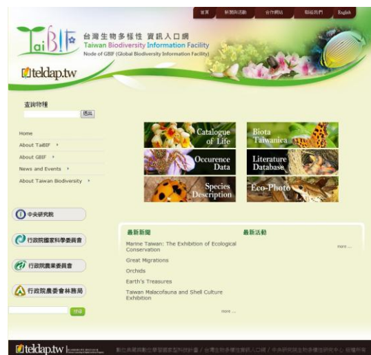
Figure 2. Homepage of TaiBIF

TaiBIF, the Taiwan node of GBIF, uses the metadata format and tools recommended by GBIF to integrate Taiwan's biodiversity information and exchange them with global community. The homepage of TaiBIF is shown in Figure 1. TaiBIF consolidates various databases in Taiwan, including species checklists, Biota Taiwanica , species occurrence data, Taiwan Encyclopedia of Life, etc. Using biodiversity informatics and tools, TaiBIF enables the general public, academic scholars, and government agencies to gain access to the data on its platform. In addition, TaiBIF introduces international data standards and protocols so that it can meet the two objectives of "deepening Taiwan people's biodiversity knowledge" and "helping to make the world's biodiversity picture more complete."