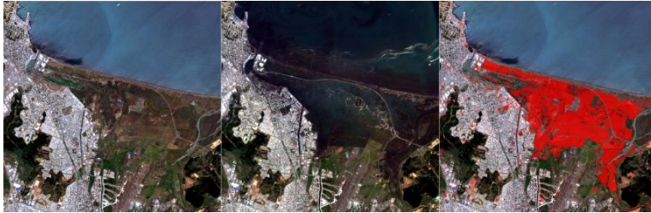
Figure 1. Damages by tsunami: City of Concepcion, Chile imaged on 10/01/2010 (left images) and 27/02/2010 (centre/right images) by the RapidEye satellite constellation. The centre image was taken eight hours after an earthquake of magnitude 8.8 had occurred and the resulting tsunami had affected the shoreline. The right map shows the areas with tsunami-related changes (red layer) on the post-tsunami image.